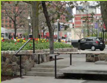
PARADISE VALLEY PARK AND PLAZA