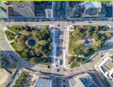
GRAND CIRCUS PARK